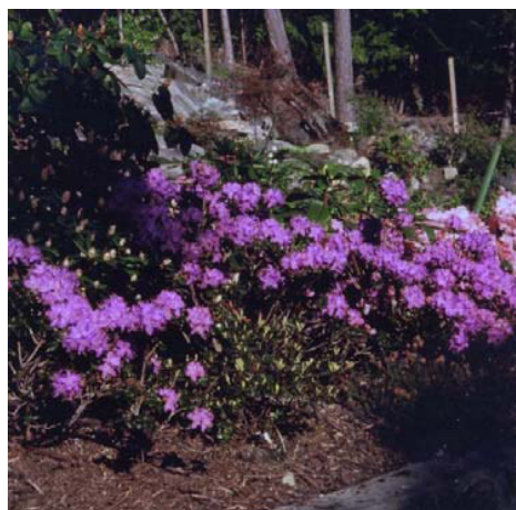
R. Bob's Blue