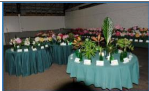
Foliage Class in the Truss Show

Consider entering a truss this year – it is not just for experts; it could be a flower, an azalea spray, or a truss into the foliage class; foliage can be stunning on its own! New members entering the show for the very first time can win a prize.