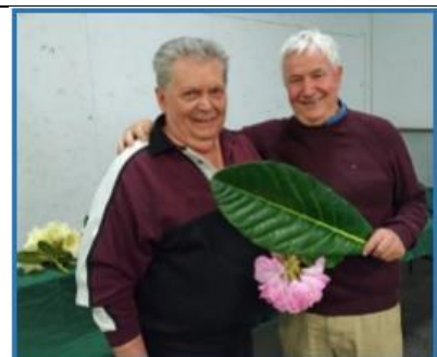
Two long term members celebrating an outstanding entry in the foliage class

Consider entering a truss this year – it is not just for experts; it could be a flower, an azalea spray, or a truss into the foliage class; foliage can be stunning on its own! New members entering the show for the very first time can win a prize.