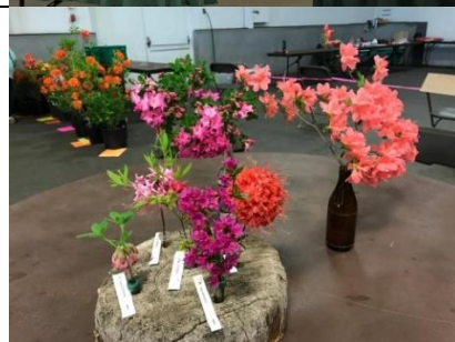
Azalea Sprays on the display table