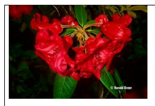
Thor won BEST IN SHOW in 2019, it has a 'Lax Truss' where the individual flowers are loose, not rigid