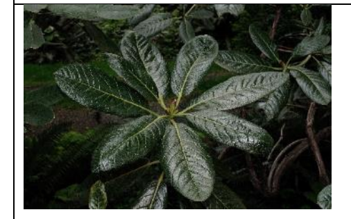
Foliage: R. macabeanum, winner of 2020 online show.