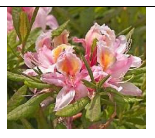
'Irene Koste'r featured in the 'Azalea (Truss or Spray)' class in 2019: Multi-stems emerging from a single stem