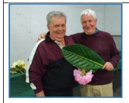
Two long term members celebrating an outstanding entry in the foliage class

Consider entering a truss this year – it is not just for experts; it could be a flower truss, an azalea spray, or a truss into the foliage class. New members entering the show for the very first time can win a prize