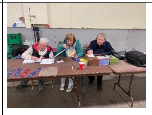
Your hard working registration scribes in 2022

Consider entering a truss this year – it is not just for experts; it could be a flower truss, an azalea spray, or a truss into the foliage class. New members entering the show for the very first time can win a prize