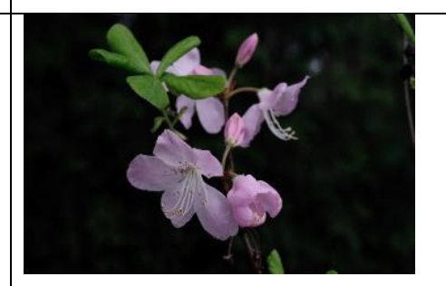
R. schippenbachii winner of 2020 online show.