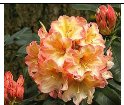
The best in show winner for 2022: Peach charm.

There will be notes recorded from the judges where they have comments to make about a specific entry.