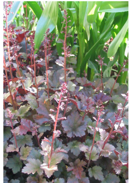
Heuchera 'Chocolate Ruffles'

good reasons. First, their hardiness to Zone 3 or 4 extends their appeal right across the country. Not surprising, since many of the 55 or so species are native to the Rockies. Second, the blooms, often bright and fragrant, are a magnet for bees and butterflies. And third, the foliage variations selected even in the last five years are almost overwhelming – ruffles, contrast veining, scallops, metallics, and more. I must make a confession though – up until a few years ago, I thought these plants were boring, with ugly mottled leaves and unassuming flowers. I think it must have been a clump of Heuchera 'Palace Purple', in the winter when everything around it was dull and bare and the glossy purple leaves just lit up the rockery, that I changed my mind. Despite this change of heart however, I think that some varieties still have ugly leaves and boring flowers, but that's just me !!