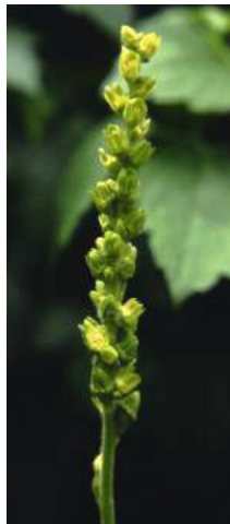
Heuchera 'Green Finch'