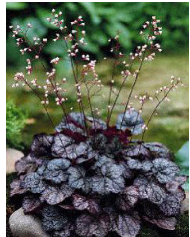
Heuchera 'Pewter Moon'