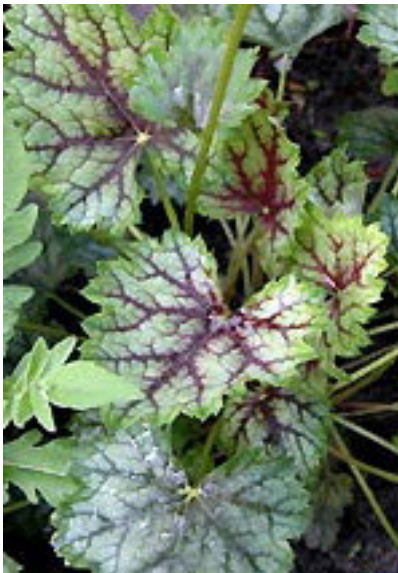
Heuchera 'Green Finch'