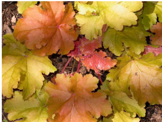
Heuchera 'Amber Waves'