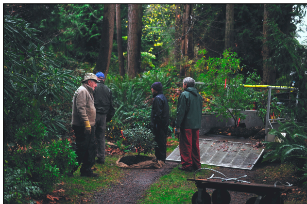
Getting Kesangiae ready

Deliveries of many species rhododendrons to the storage area of Milner Gardens and Woodlands in preparation for next spring's species planting