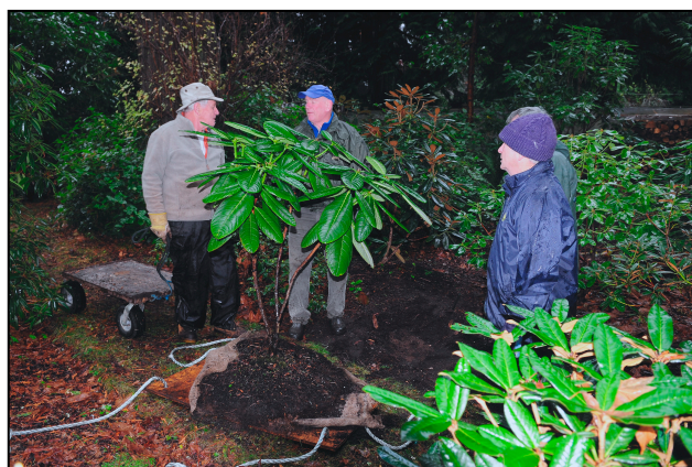
Heading for Milner's new species garden