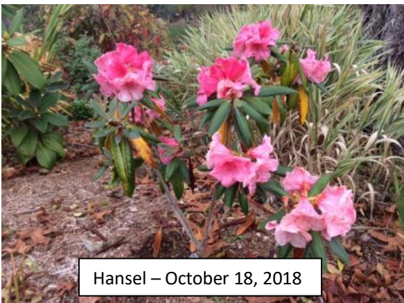
Hansel – October 18, 2018