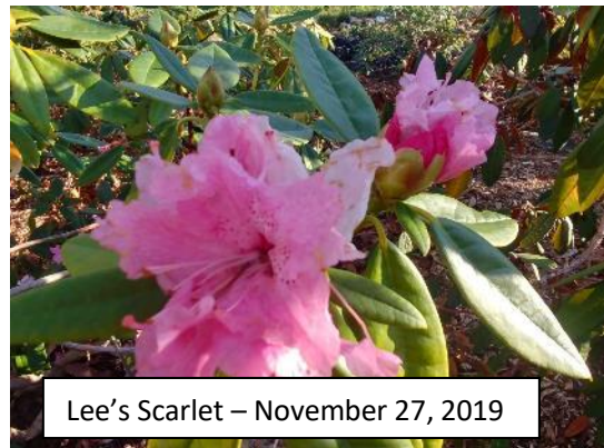
Lee's Scarlet – November 27, 2019