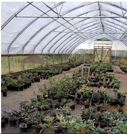
One of many hoop houses at the RSBG - so many plants to choose from and difficult decisions to make.