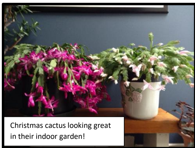
Christmas cactus looking great in their indoor garden!