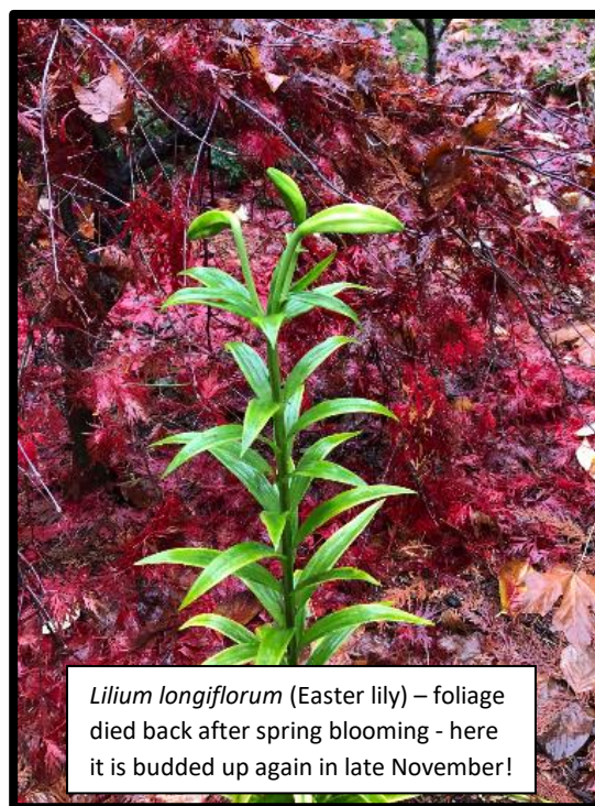
Lilium longiflorum (Easter lily) – foliage died back after spring blooming - here it is budded up again in late November!

"Autumn carries more gold in its pocket than all the other seasons." ~Jim Bishop