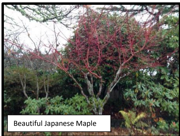
Beautiful Japanese Maple