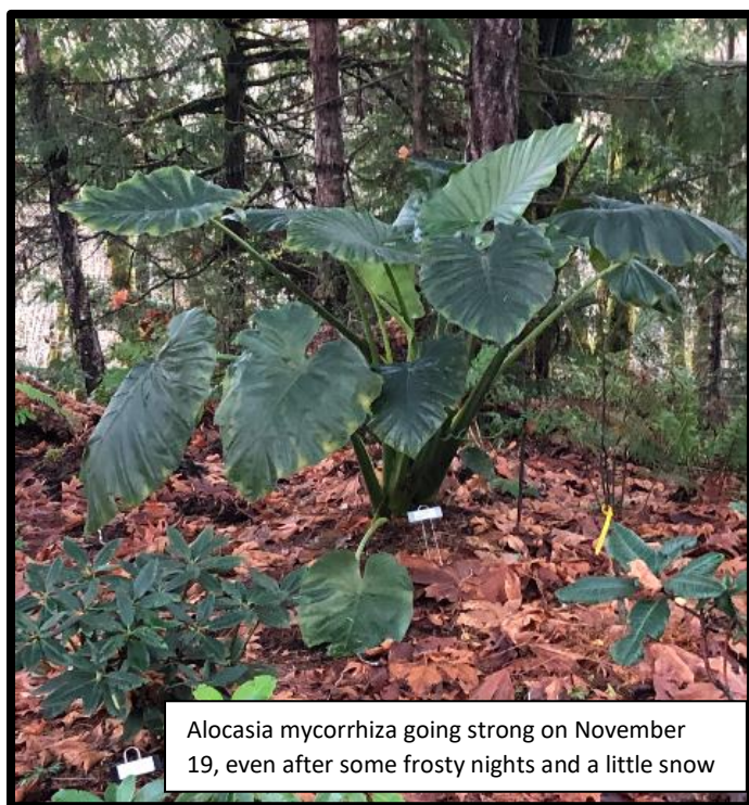
Alocasia mycorrhiza going strong on November 19, even after some frosty nights and a little snow