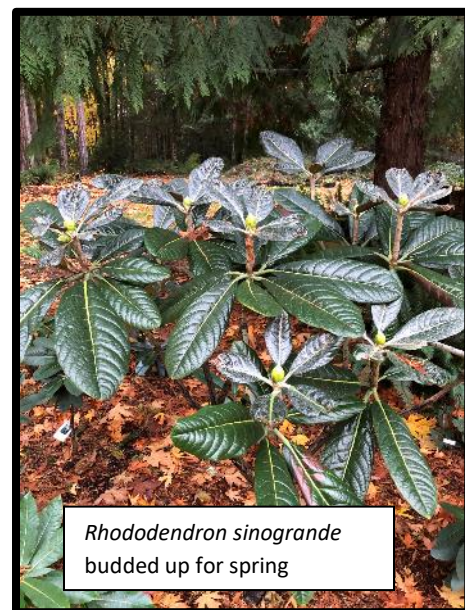
Rhododendron sinogrande budded up for spring