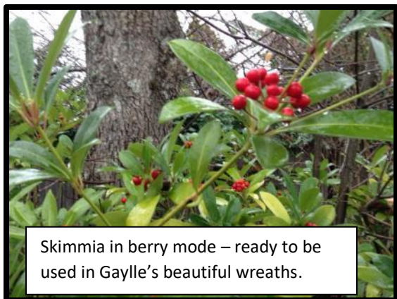
Skimmia in berry mode – ready to be used in Gaylle's beautiful wreaths.