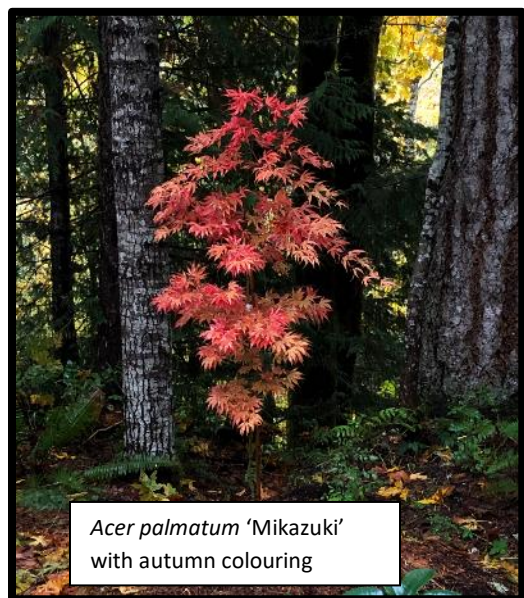
Acer palmatum 'Mikazuki' with autumn colouring