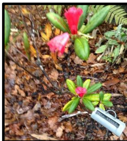
As Gaylle says, "R. 'Noyo Brave' not looking very brave at all 😊"