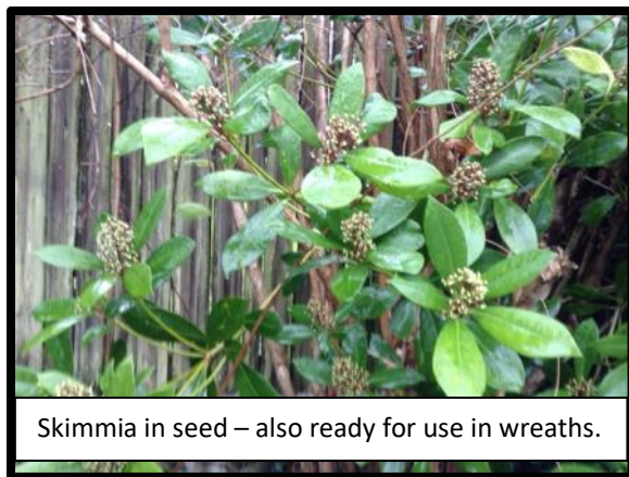
Skimmia in seed – also ready for use in wreaths.