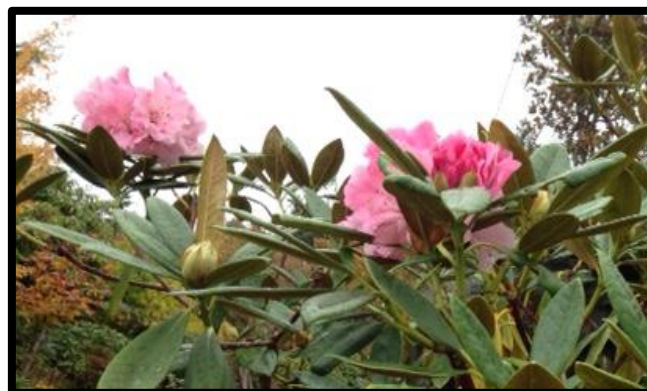
R. 'Lee's Scarlet' in bloom despite the rain 😊