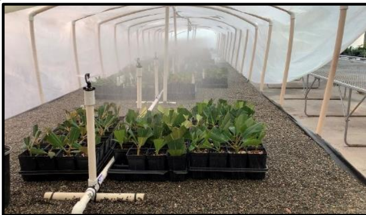
Research Rhododendrons in Mist Tent