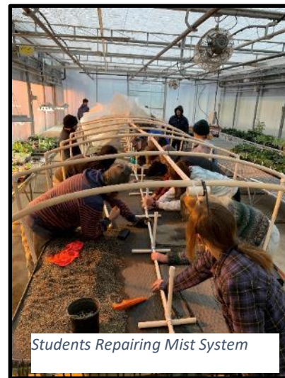
Students Repairing Mist System

Monitoring and care of the research cuttings are carried out using the (ARS) propagation and care guidelines that can be found here https://www.rhododendron.org/propagation.htm . Each week, I use the record-keeping sheet that I created to collect data on the research cuttings. Additionally, I collect environmental data such as temperature and humidity and track cultural requirements, such as watering or pest and disease pressures. The data I collect on the mist tent environment and the cultural activities will be useful when making decisions for this year's cutting growth and in future years. In addition to the weekly record-keeping, I stop in and check on the cuttings between classes during the week to see if the mist system is operating correctly or if there are any changes in crop growth. Another tool I use for monitoring the health and growth of the research cuttings is using a sample collection of Rhododendron cuttings outside of the research scope for reference. I use the reference Rhododendron cuttings to look at signs of early callousing, overwatering, and other root zone issues. In using this sample collection of cuttings, I can infer what may be happening