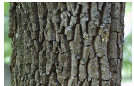
The deeply fissured bark of a mature tree