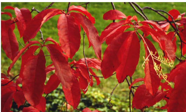
The somewhat glossy ovoid leaves give brilliant fall colour