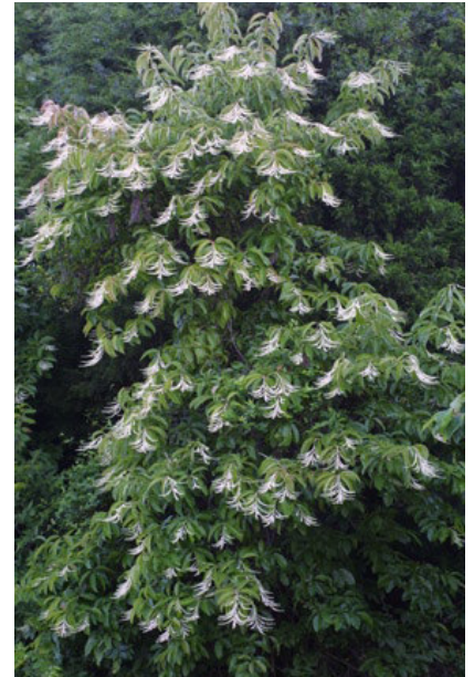
The swooping panicles of pieris-like blossoms accentuate Oxydendrum's graceful habit

no serious pests, and pruning is rarely required. The wood is heavy and dense, and though currently it has little value as timber, it remains popular for turnery and was once used as sleigh runners. Not available in every plant center, I recommend you ask them to search one out for you. Happy planting!