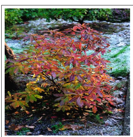
R. luteum fall colour with frost Nov 27.

R. "Species nova" – not officially named.