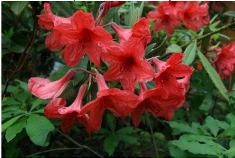
R. griersonianum.