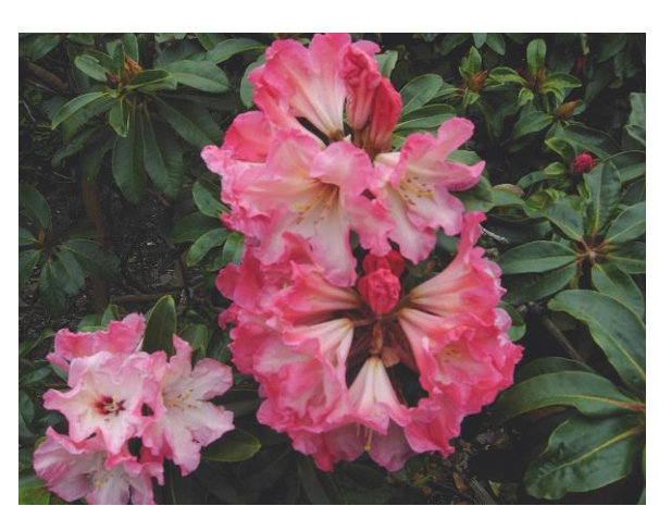
R. 'Ooh Gina -15°C Flower openly funnel-shaped, 3½" across, faint fragrance, vivid red, rose edges and star-shaped cardinal red blotch. Held in ball-shaped truss of 15 flowers. Fragrant: Yes slightly Bloom Time: Late Midseason Foliage Description / Plant Habit: Leaves narrowly elliptic to elliptic, 5" long, emerald green, retained 3-4 years. Bronze colored when new. Rounded habit, stiff, Broader than Tall. Height: 3 feet in 10 years. Parentage Golden Belle x Lem's Cameo.