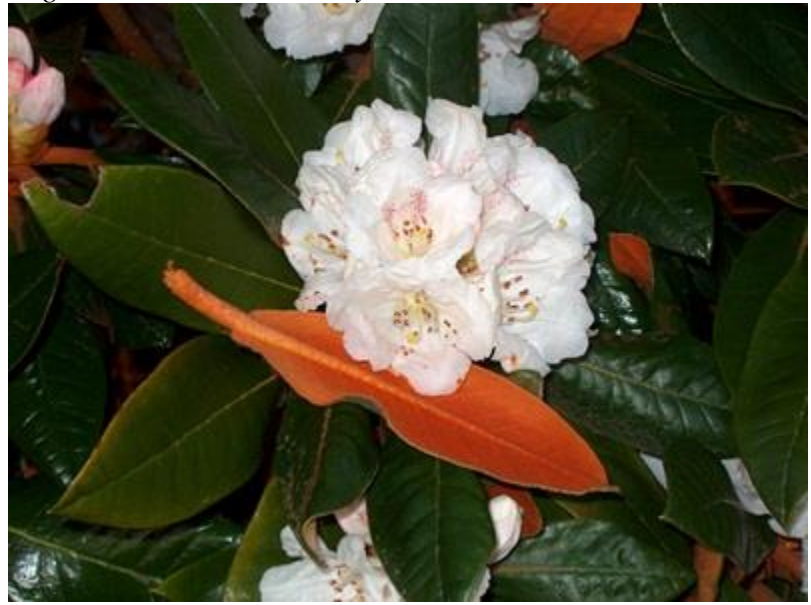
R. bureauvii