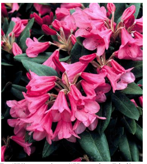
R. 'Winsome' — ('Humming Bird' x griersonianum) 3', 0°F, EM, 3-4/4. The plant is compact with small pointed foliage, and sets attractive reddish flower buds which you get to enjoy all winter. It flowers extremely heavily with beautiful rosy cerise flowers.