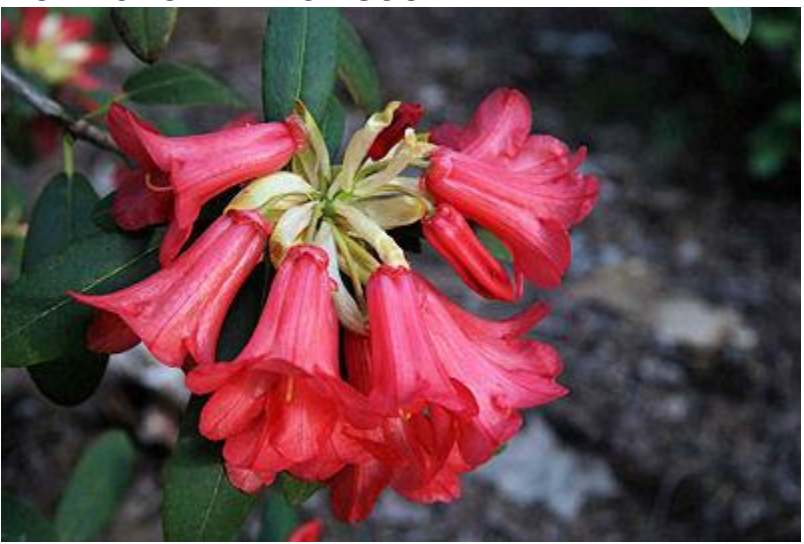
R. dichroanthum ssp dichroanthum.