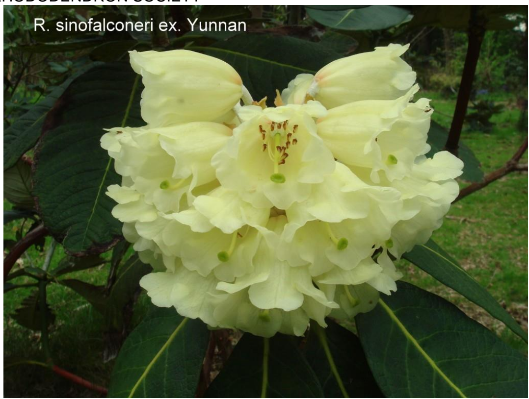
From the mountains on either side of the Yunnan-Vietnam border comes the newly introduced, yellow-flowered, big-leaf R. sinofalconeri . Click here for the description on the Rhododendron Species Foundation website.

Rhododendron rigidum — (RN, rn, Triflora) 5', -20°C, EM, 4/3. This very beautiful species, when in full flower, appears as a cloud of smoky pink. Wide, funnel- shaped flowers are white to pink or intense rosy lavender and occasionally spotted red.