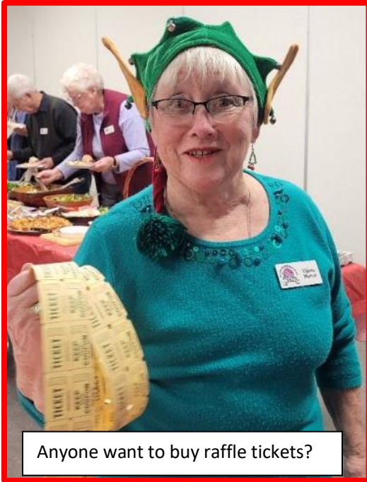
Anyone want to buy raffle tickets?

We tried something a little different this year. Rather than lots of traditional auction items, we had a larger silent auction, a raffle, two mystery items and a Dutch auction. Coupled with a lively Christmas bingo which had everyone mingling and socializing, and the usual great food, it was a fun evening. In the spirit of the season, we raised $960 through the auction and raffle, as well as a significant donation to Loaves and Fishes!!