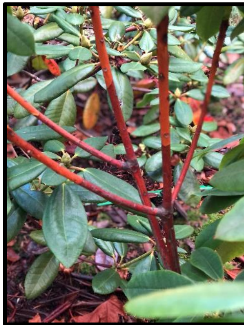
Coloured branch structure - photo taken November 2, 2023