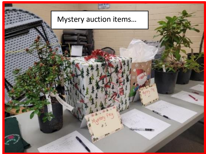
Mystery auction items...