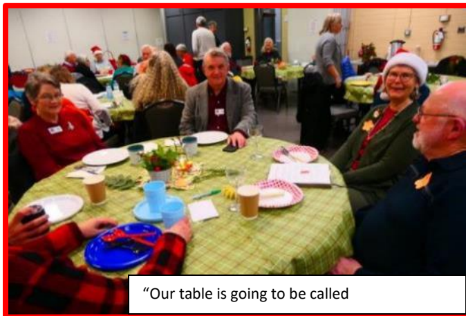
"Our table is going to be called