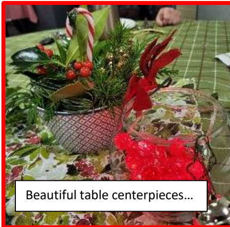
Beautiful table centerpieces...

Special thanks go to our organizing committee who put it all together!! It worked out so well!