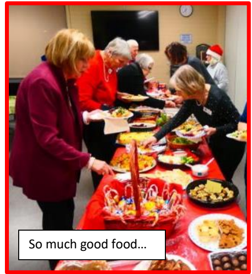
So much good food...