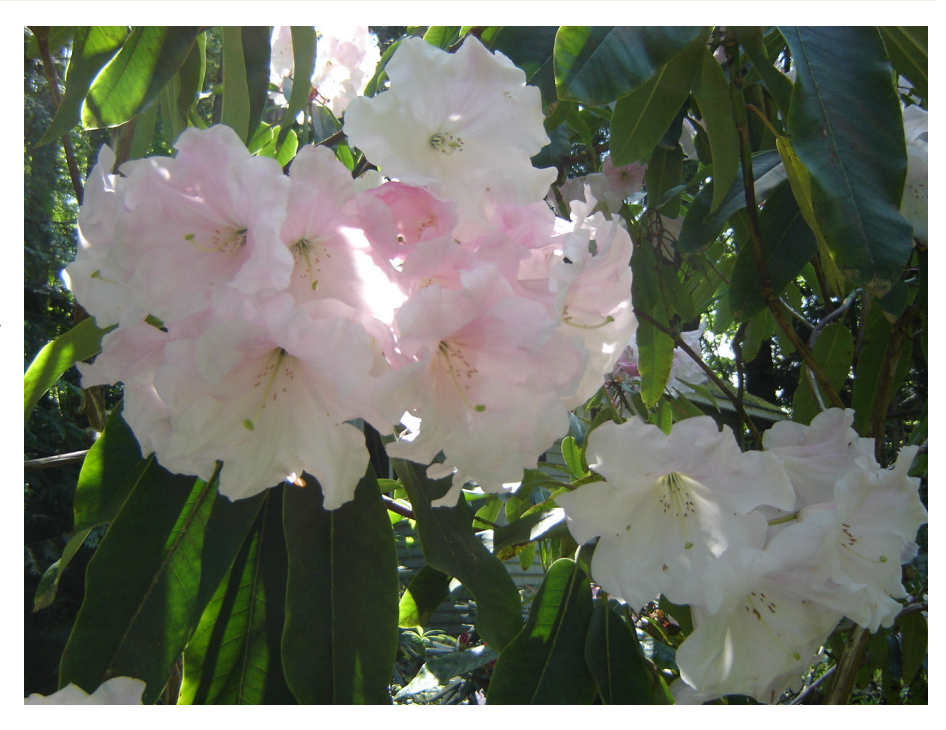
R. 'Loderi Venus' in my garden -editor

For over two decades, you have been an ambassador for the genus rhododendron and an avid promoter of membership and participation in the American Rhododendron Society. As founding member of the North Island Rhododendron Society, you have worked tirelessly as President and Director throughout the Chapter's history. You have been instrumental in the development of both your own "Haida Gold Gardens" and the public "Comox Valley Rhododendron Garden", providing enjoyment to countless citizens and visitors. As a speaker, teacher, writer, propagator and hybridizer, you have ensured that rhododendrons maintain a high profile. As Director of District 1, your support of individual Chapters and encouragement of interactive sharing has emphasized both education and fellowship. You are an inspiration to all members of the American Rhododendron Society.