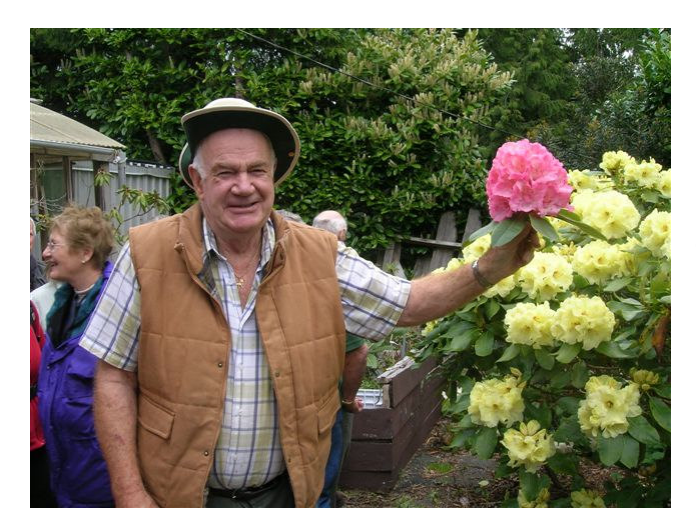
At the Chase and Warren winery