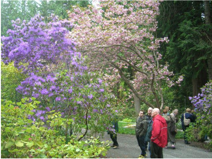
Milner Garden and Woodland