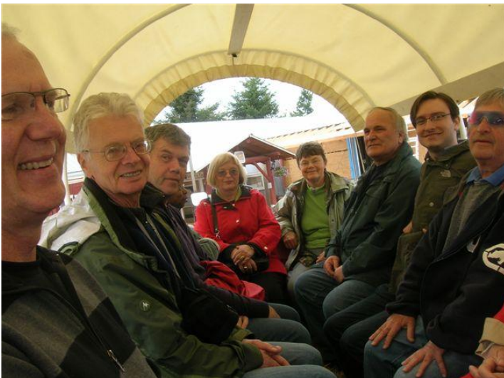
At Morningstar Farm