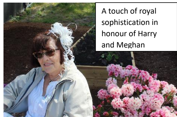
A touch of royal sophistication in honour of Harry and Meghan