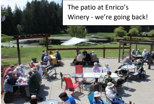
The patio at Enrico's Winery - we're going back!