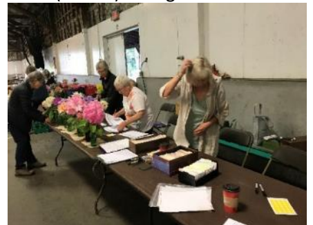
Well, what class is that exactly....