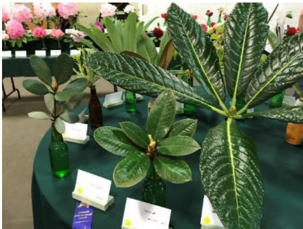
Foliage winners: 1 st Mallotum (on left), 2 nd Sinogrande (on right) and 3 rd bureavii.

A general comment for the whole display was that the trusses were too crowded, especially in light of the fact that we did have some extra space. We had a hard time making the deadline of 8am to start judging this year; lots of classes to be checked for the entries, and over half the entries arrived on Saturday morning – but we made it!