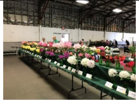
Worker bees setting up the Truss show, with the plant sale in the background.