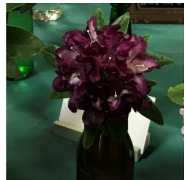
.... We think it is Midnight Mystique on the display table. I love the colour.