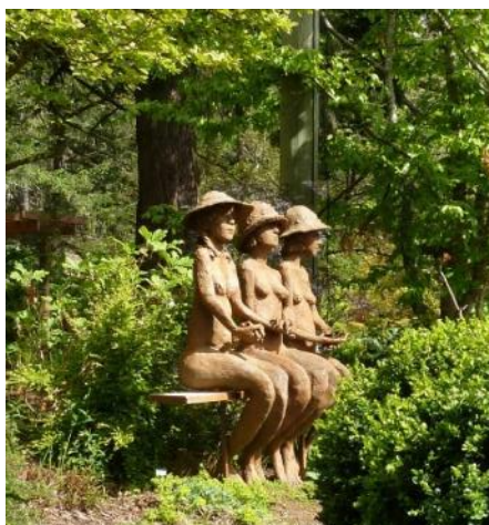
You never know what you'll find around the next corner at Russell Nursery.