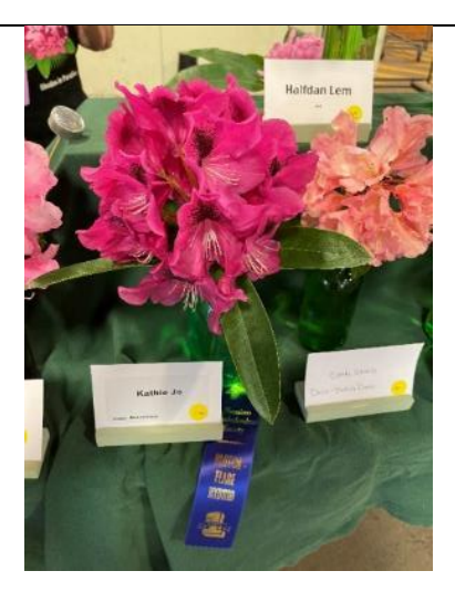
Above: A view of the Novice Class display table

The blotch/flare winner 'Kathie Jo' was also the people's choice