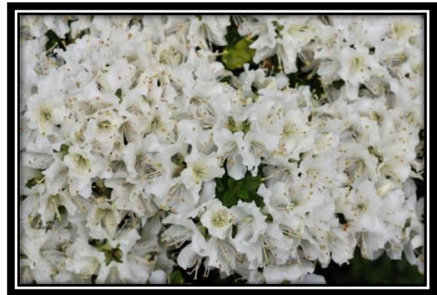
R. Kiusianum

One of my most favourite rhodos is the white form of R. kiusianum . It is deciduous, but the branching stems are exquisite even in winter as they have a branching habit that is very "oriental" in form. When this lovely little plant blooms, it is covered in white and the new foliage is a beautiful fresh green.