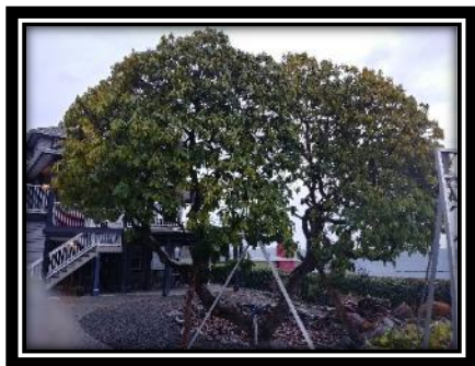
The nearly finished product