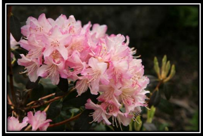
"Ginny Gee"

One of my most favourite rhodos is the white form of R. kiusianum . It is deciduous, but the branching stems are exquisite even in winter as they have a branching habit that is very "oriental" in form. When this lovely little plant blooms, it is covered in white and the new foliage is a beautiful fresh green.