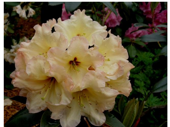
O' Canada 2