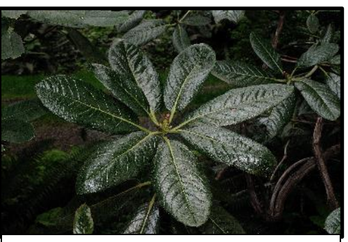
R. macabeanum