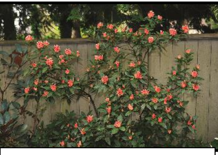
R. spinuliferum