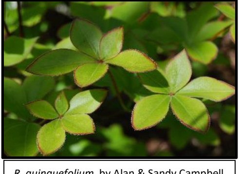
R. quinquefolium