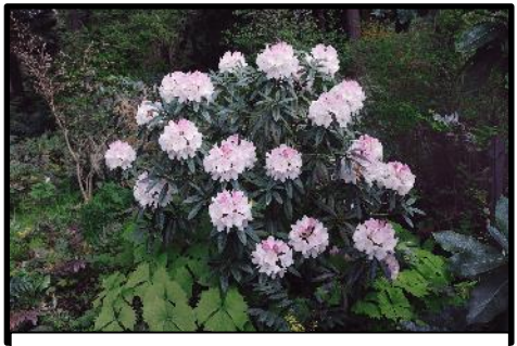
R. morii