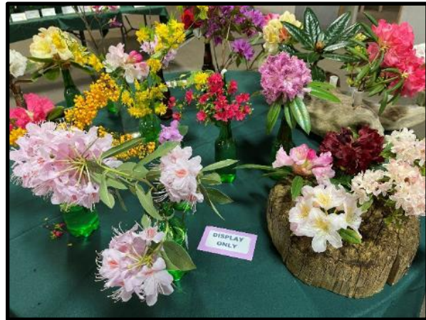
One of our two display tables – both absolutely spectacular.