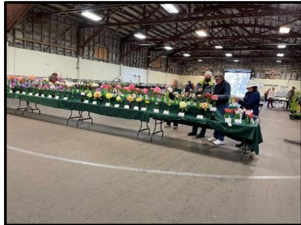
Judges frowning in consideration, with judge assistants looking on and making notes