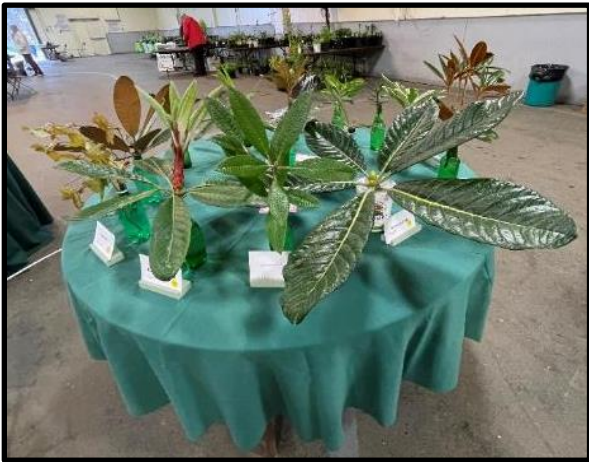
The foliage table; always an eye opener.