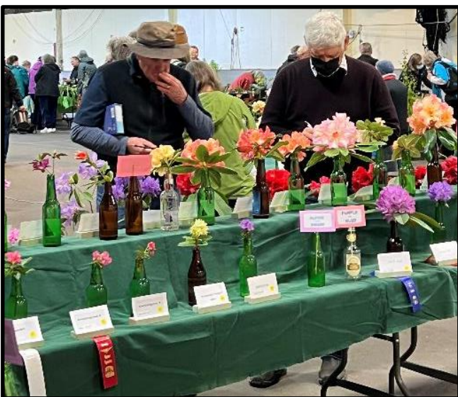
Our judges hard at work

Our club wishes to congratulate all of our winners and thank them for supporting our club.