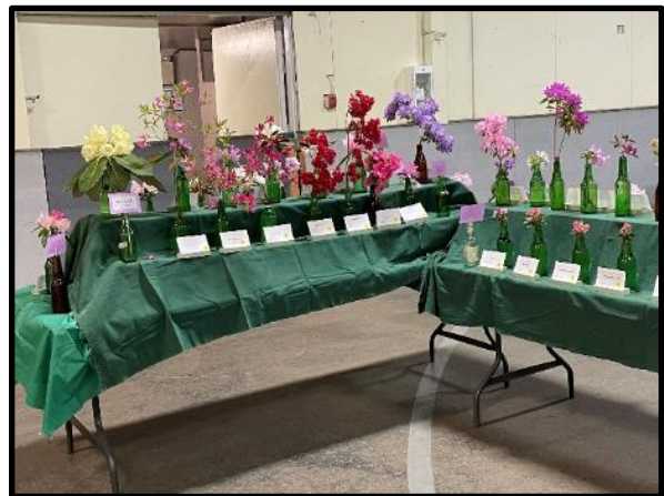
The sprays: Azaleas, Elepidotes and dwarf/alpine looking very impressive. More in evidence with early season.