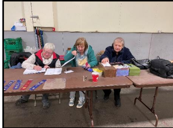
Entry Scribes identifying, finding cards and writing up at 7am on Saturday – it is cold in here!