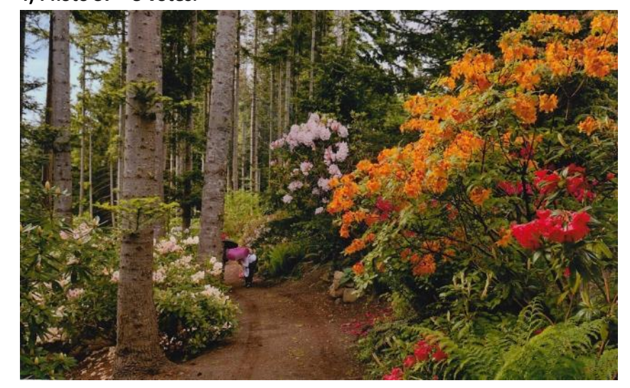
Bob Smith's garden, Comox