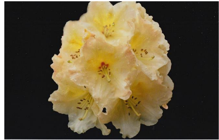
R. 'Horizon Monarch'