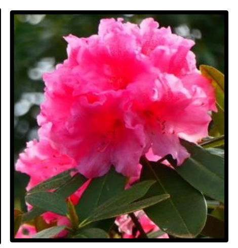
Our heartfelt thanks to those great gardeners who opened their gardens to us!