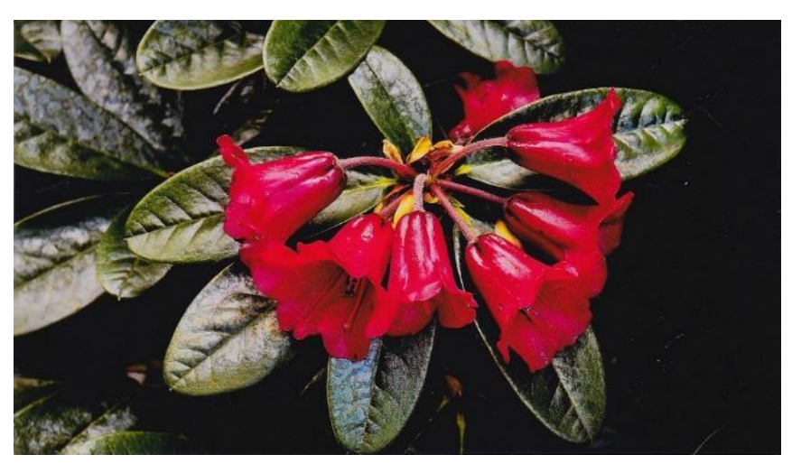
R. haematoides