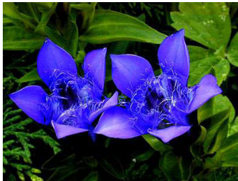
Gentiana septemfida (Crested Gentian) showing the "seven cuts" of the crest

They are quite particular as to growing conditions, and poor locations tend to encourage leaf diseases. Slugs can be dissuaded by a good dressing of grit around the base. All gentians prefer drainable light humus soil that does not dry out in summer, and partial shade. Spring and early summer bloomers can tolerate a neutral soil, but the later they bloom, the more necessary an acidic soil.