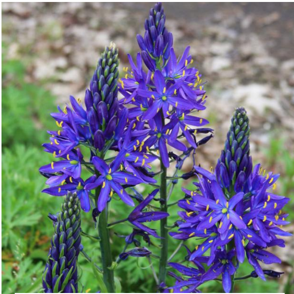
Camassia Quamash blue form

Q is for Quamash of the Lily Family Family: Liliaceae