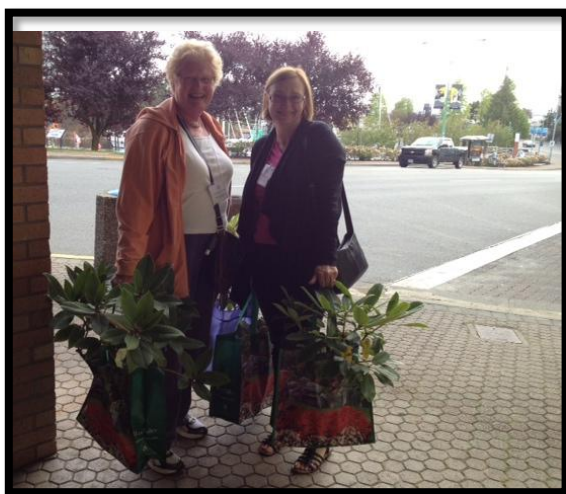
Heading for the ferry