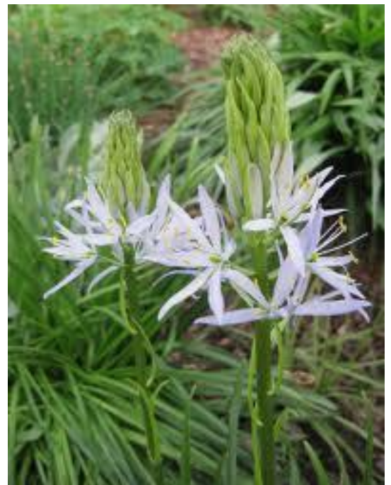
Camassia Quamash white form

This is a lovely bulb-forming perennial native to moist meadowlands in various parts of North America - some in our own backyard. Elegant tapering racemes of starry blooms in blue (yum), purple or white stand well above narrow sage-green basal leaves. They create a perfect upright accent among our blocky rhodos AND they bloom during the peak rhodo colour season.