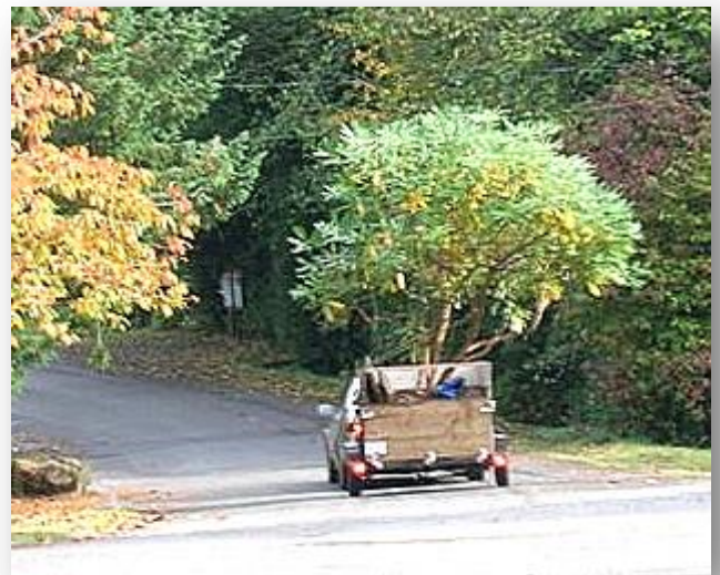
R. diaprepes for a new home