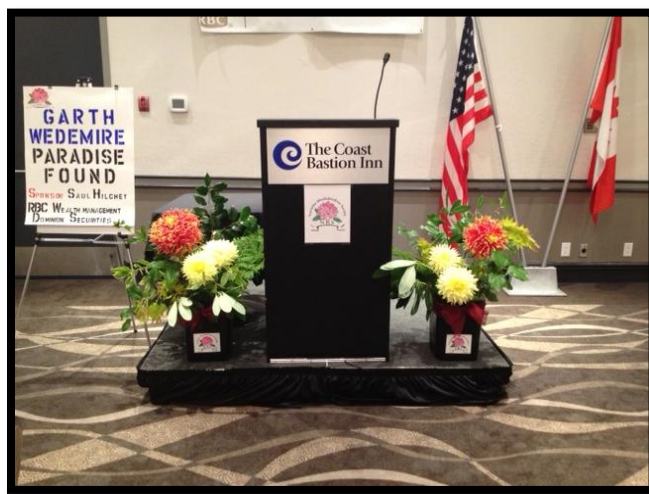
The Main Podium