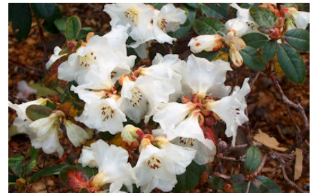
R. 'Snow Lady'

Rhododendron 'Snow Lady' ( Rhododendron leucaspis x Rhododendron ciliatum ) – This charming rhododendron is one of a few that will flower in shade and the pure white blooms really stand out. These are usually borne from March to April over fuzzy green rounded leaves. This is a good choice for those north-facing foundation beds. Grows 3' tall by 3-4' wide. Hardy to zone 6.