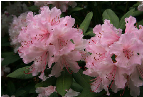
R. 'Christmas Cheer'