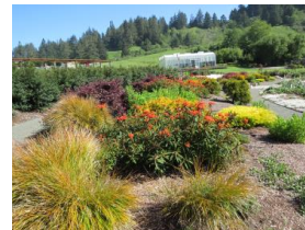
HUMBOLDT BOTANICAL GARDEN