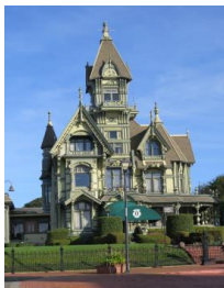
THE CARSON MANSION

For many ARS members, seeing the Redwoods ( Sequoia sempervirens ) is high on the must see "bucket list", as are the rugged North Coast of California with its Rhododendron macrophyllum and Stagecoach Hill, the home of the Smith-Mossman 1966 collections of Rhododendron occidentale azaleas.