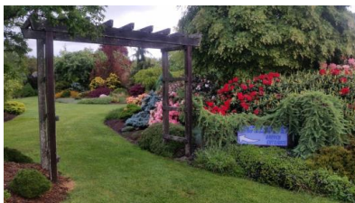
SINGING TREE GARDENS

Eureka is served by United Express twice daily from San Francisco. Flying to San Francisco and transferring to Eureka is the usual air transport option. Renting a car in San Francisco and driving to Eureka is a very scenic alternative. Drive time from San Francisco is about seven hours through the wine country with its rolling hills and on north through the Coast Range mountains and redwood forests.