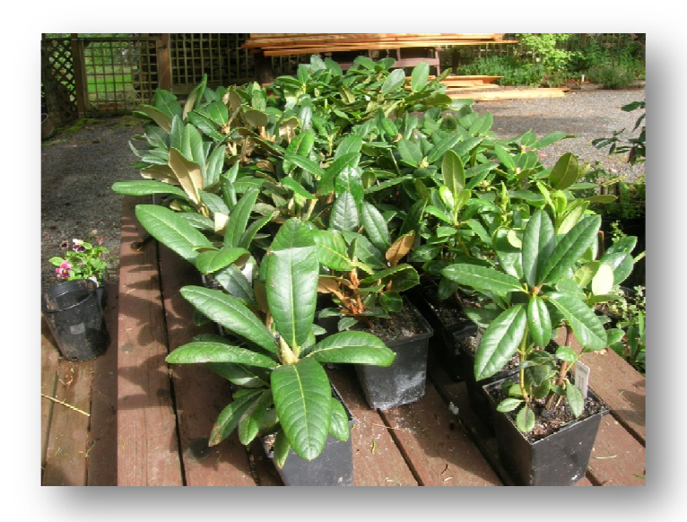
Way to Grow! Our Briggs Nursery Plants have arrived!