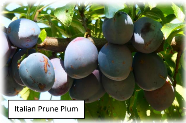
Italian Prune Plum