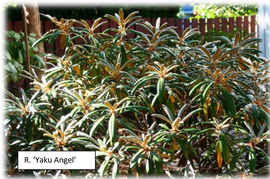
R. 'Yaku Angel'