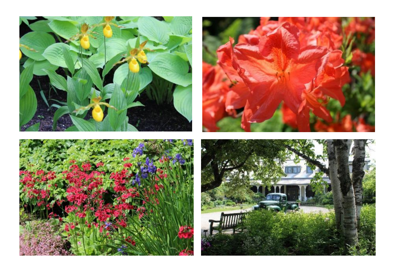
Looking forward to seeing you all at the September meeting! Remember we're starting early at 6:30!

If you're ever in the area, check it out! Here are a few photos: