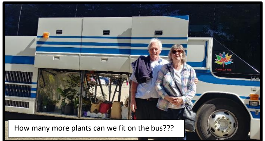
How many more plants can we fit on the bus???