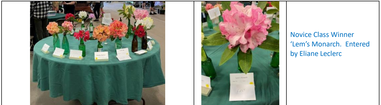
Above: A view of the Novice Class display table