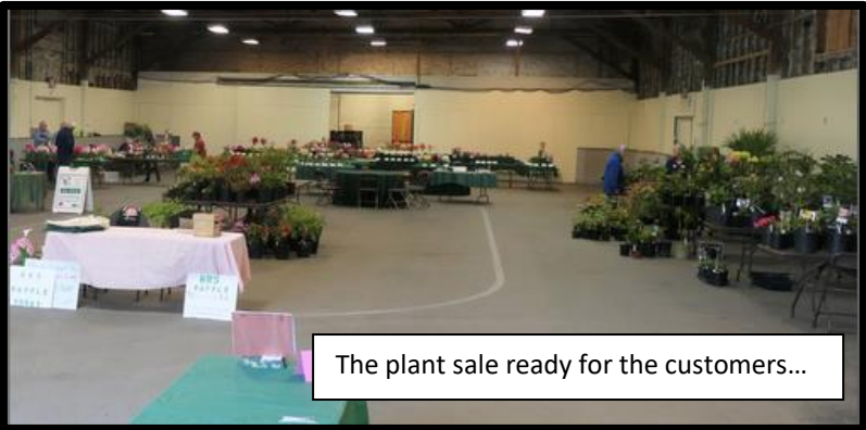
The plant sale ready for the customers...