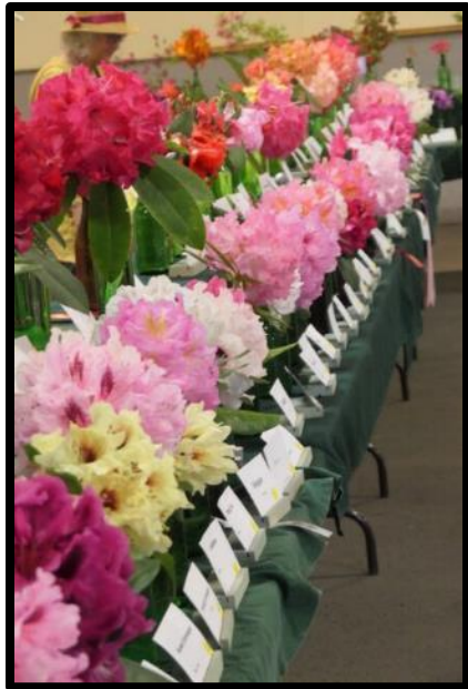
Wonderful show of colour as always in the truss show